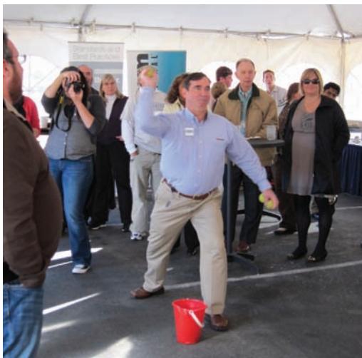
Staff played games to raise money for Habitat for Humanity of Northern Virginia.