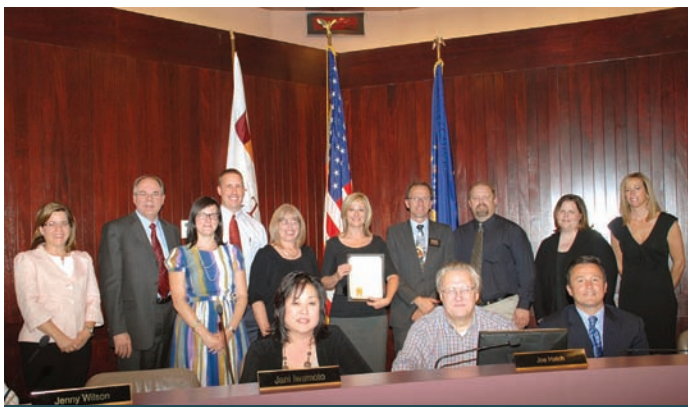
Lake County Mayor Peter Corroon signs AV Week Proclamation with Listen staff.