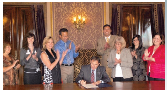
Utah Governor Gary Herbert signs AV Week Proclamation surrounded by Listen staff