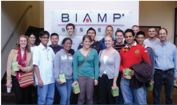
Students from the University of Portland tour Biamp's offices.