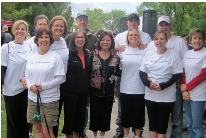
The Listen Trek Team raised over $2,700 for the Hearing Loss Association of America by participating in its Walk4Hearing.