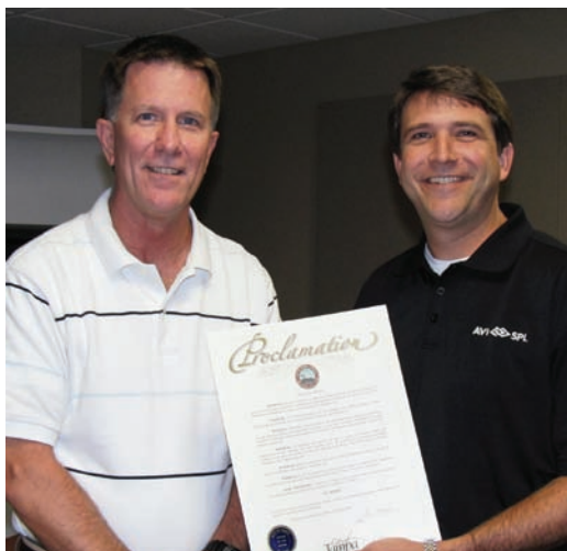
AVI-SPL staff show off an AV Week proclamation from Tampa's Mayor Pam Iorio.