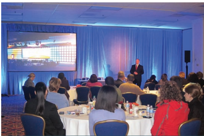
Meeting planners learn about the latest AV innovations at InfoComm's Power of AV for Meeting Planners.