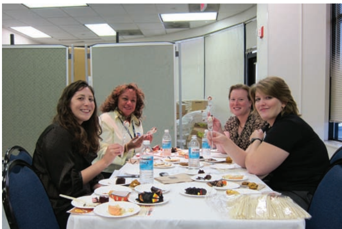
Staff and members enjoy a sweet bite while judging InfoComm's Second Annual InfoBake.