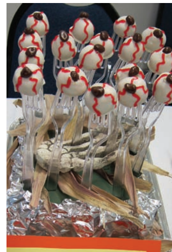
Creepy Eyeball cookies take home a prize at InfoComm's InfoBake 2010.