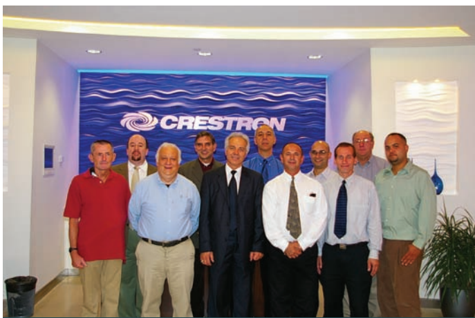
Crestron celebrates AV Week by announcing 10 new hires.